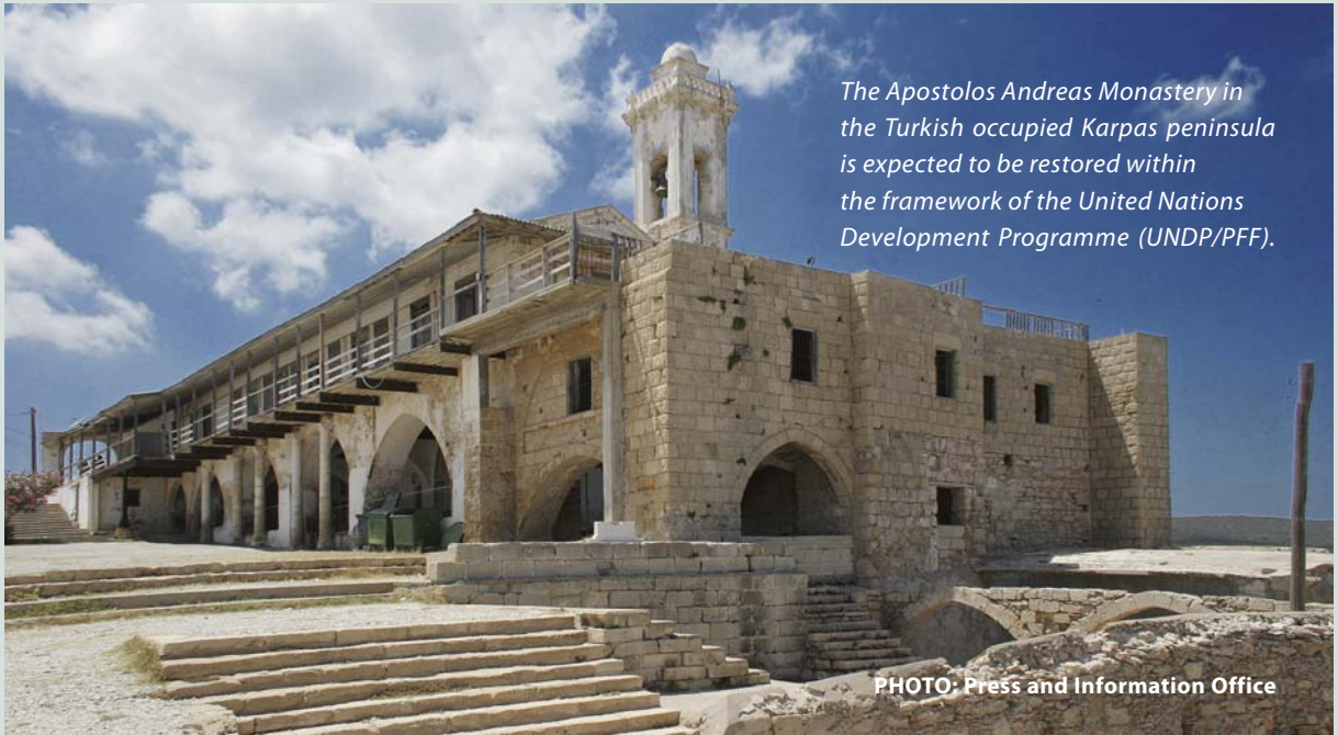
The Apostolos Andreas Monastery in the Turkish occupied Karpas peninsula is expected to be restored within the framework of the United Nations Development Programme (UNDP/PFF).